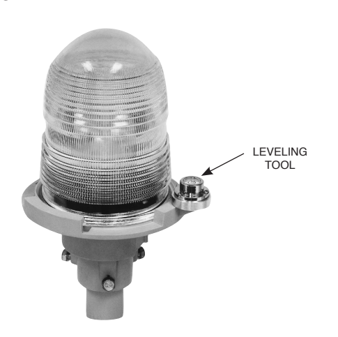
50029 Leveling Tool-ERL