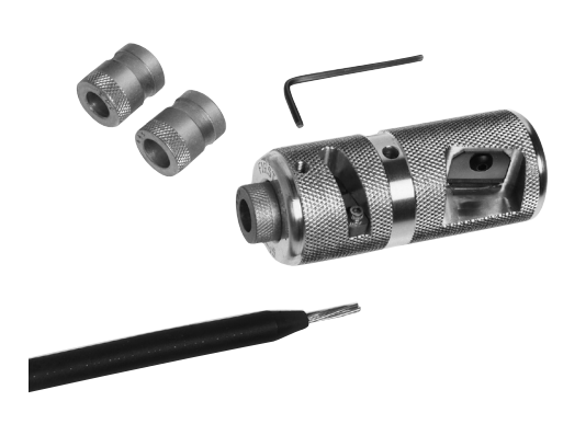
10036-36 Cable Penciller